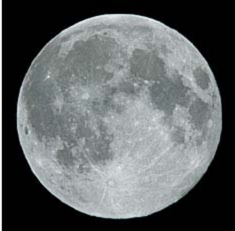
Many Lunar 100 selections are plainly visible in this image of the full Moon, while others require a more detailed view, different illumination, or favorable libration. North is up.

Just about every telescope user is familiar with French comet hunter Charles Messier's catalog of fuzzy objects. Messier's 18th-century listing of 109 galaxies, clusters, and nebulae contains some of the largest, brightest, and most visually interesting deep-sky treasures visible from the Northern Hemisphere. Little wonder that observing all the M objects is regarded as a virtual rite of passage for amateur astronomers.